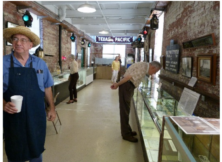
Interior of Railroad Museum