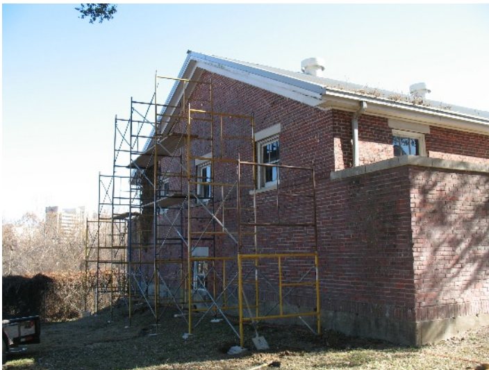
View of north wall of filter wing