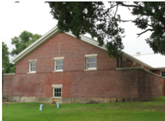
East end of filter wing of pumphouse

When the filter wing repointing eventually gets finished, that will complete the work on all the exterior spots that need work right now. We've only been working on the outside so far, which is the most important, but the mortar is crumbling on many of the inside