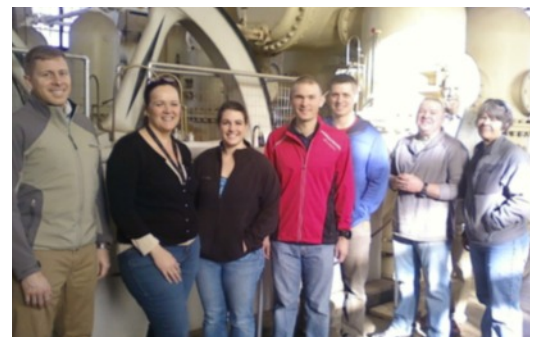
Capability Assessment Division, AF Global Strike Command

inquisitive pack of Cub Scouts, and a hardworking group from Global Strike Command. Come again everyone!