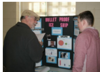
Judge with a project at home school science fair

from Airline and Bossier High Schools, the local home school association's science fair, Leadership Shreveport from the Chamber of Commerce, the Steadman wedding reception, a lively and