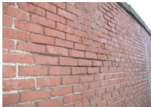
Wall needing new mortar. Looks even worse than this in some places.